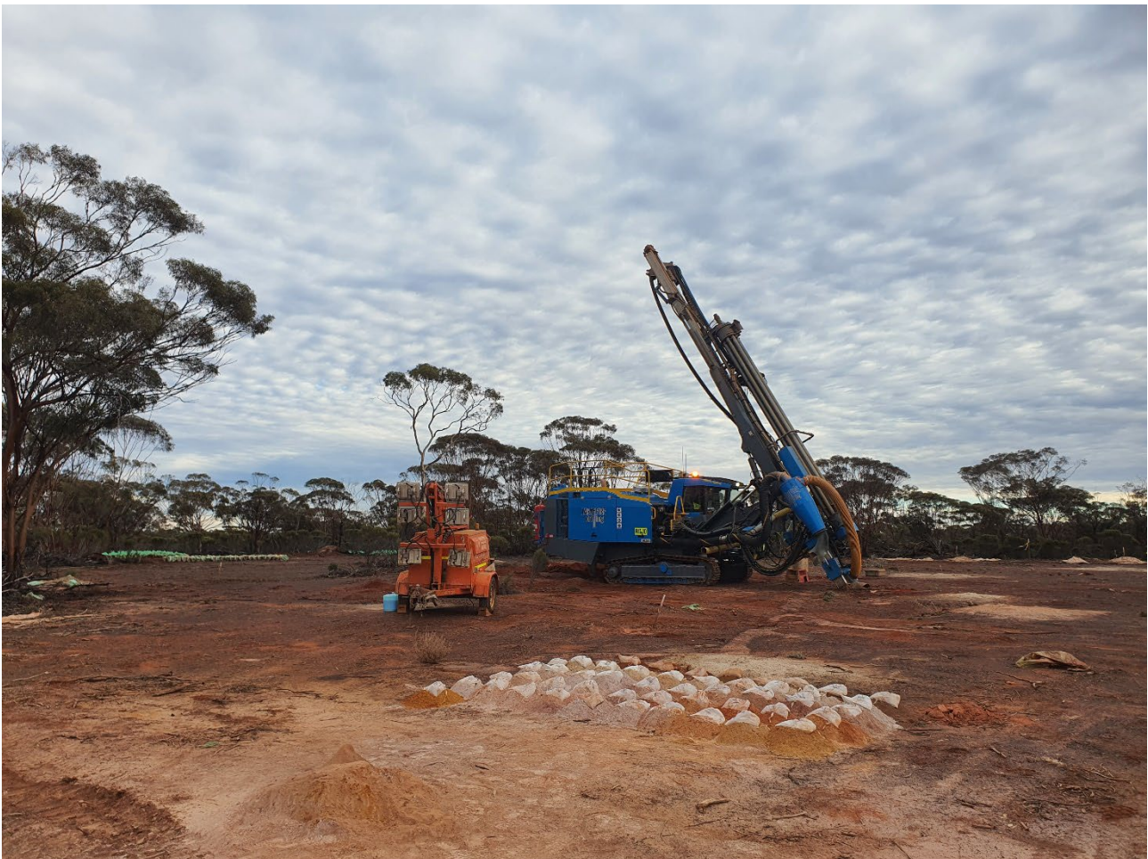
Figure 1: Rig and ancillary equipment on site at Myhree to complete grade control of the Ore Reserve.