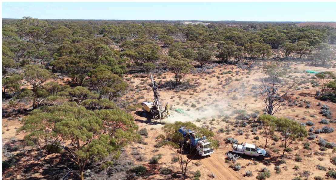
Figure 1: RC rig drilling extensional holes at Jones Find