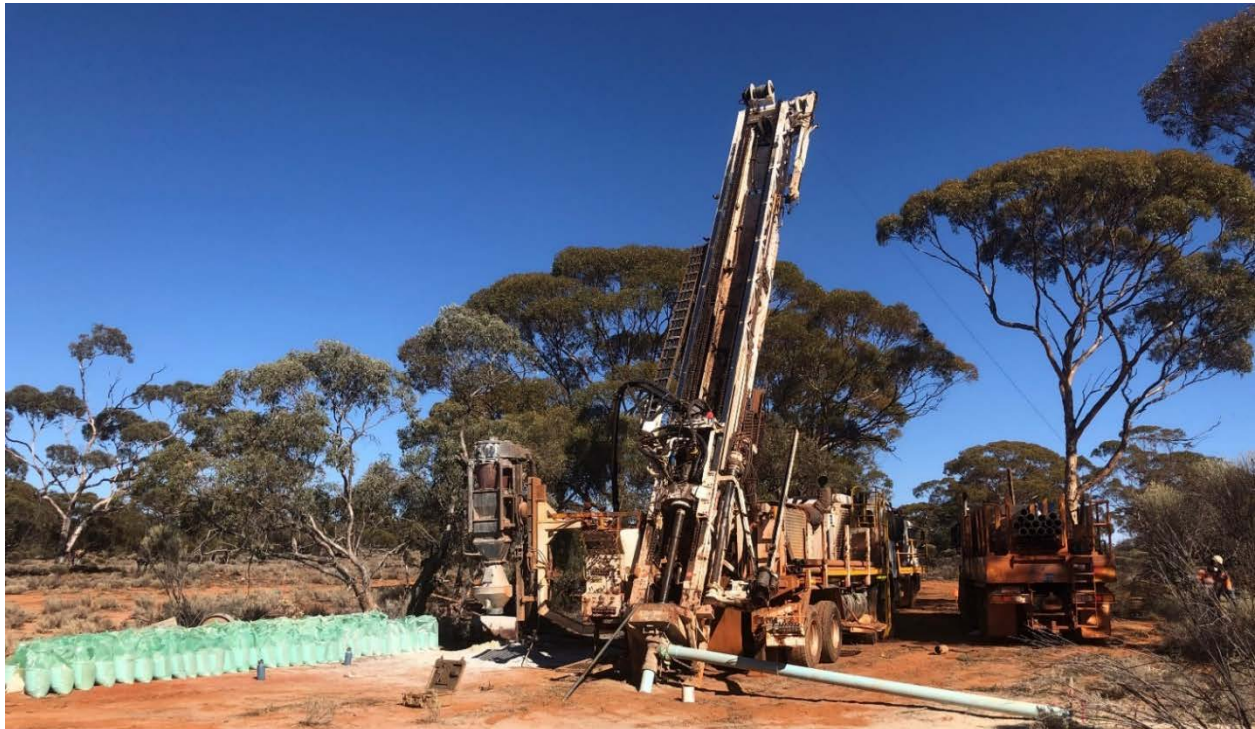
Figure 2: RC rig commencing first drilling at Rowe's Find since 2012